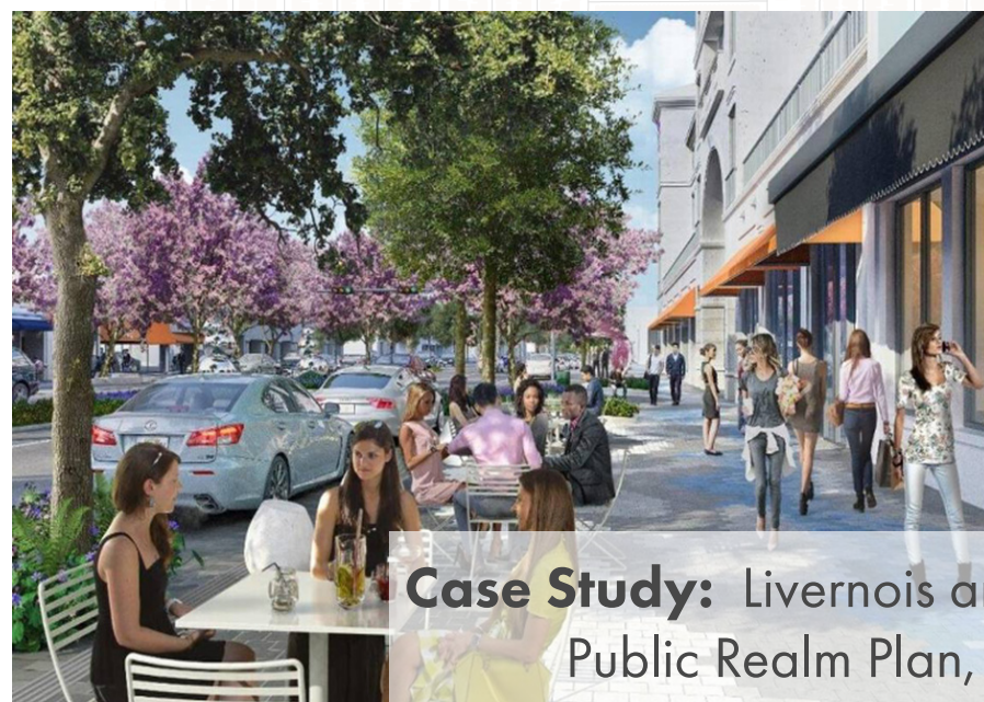
Case Study: Livernois and McNichols Public Realm Plan, Detroit

The creation of a commercial connecting path, the DIMO (Dlagonal from MOyamensing) Triangle, that circulates food traffic and unites the three commercial corridors into a vibrant destination that attracts consumers and business investments.