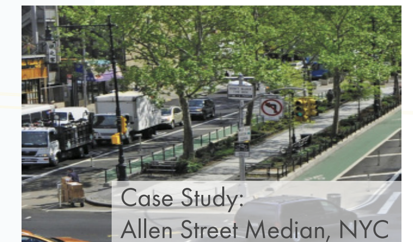
Case Study: Allen Street Median, NYC

Improvements to bike networks, sidewalks and transit station--with emphasis the Oregon Ave median--to support multimodal transportation and facilitate the movement of bicyclists, pedestrians and transit riders; turning Oregon Ave East into a convenient and attractive Phila destination.