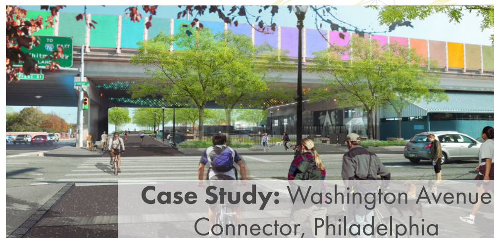
Case Study: Washington Avenue Connector, Philadelphia

New route provides a gateway that connect Oregon Ave to the Stadium District to the south, better orienting Oregon Avenue as both an attractive thruway on the way to events and a recreation destination in its own right.